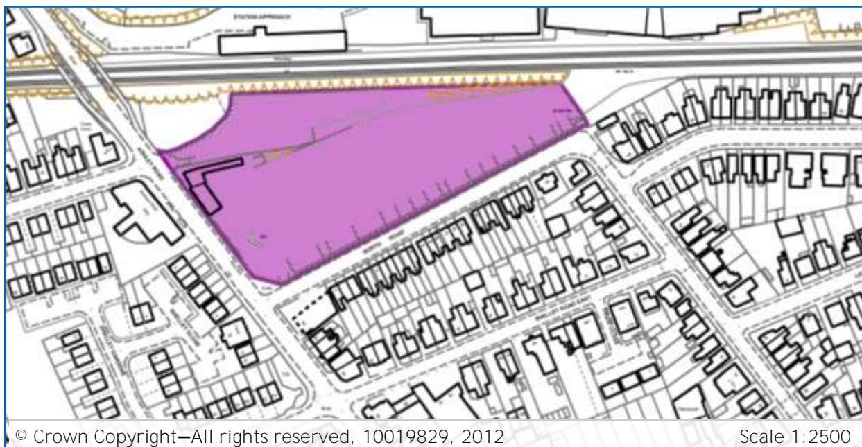
Map 3: Ashley Road Coal Yard Employment Allocation